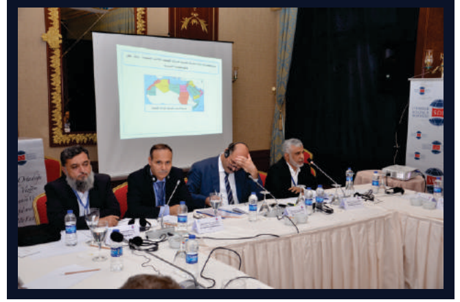
The international seminar of the participants of the research centers of the region in Turkey