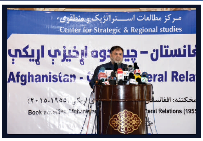
Conference On: Afghanistan - China bilateral Relations