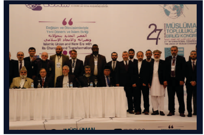
Islamic Union and New Era with its Changes and Transformations