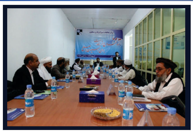
Round table discussion organized on the "Way out of the Deadlock to Reach Peace"