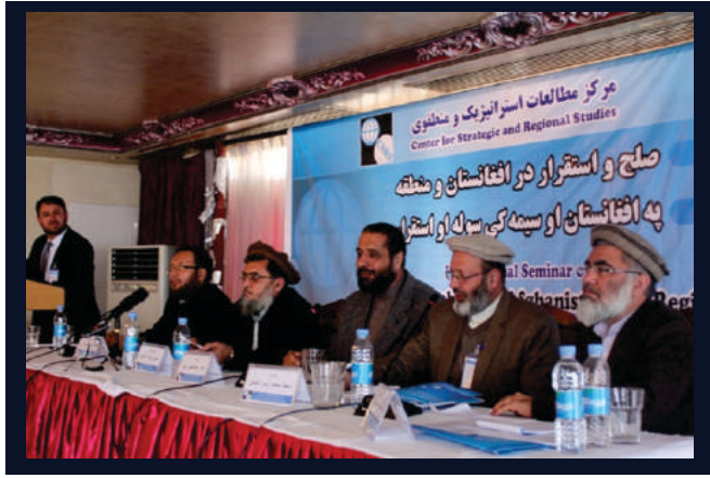
International Seminar On: Peace and Stability in Afghanistan and Region