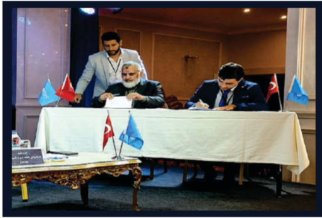
MoU Between (CSRS) Kabul, Afghanistan and Center for Political and Consultative Studies-Barq-Istanbul (BARQ)