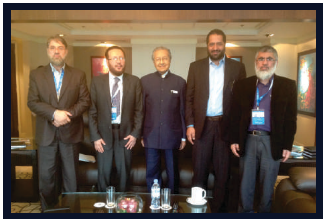
Kuala Lumpur International Annual Seminar