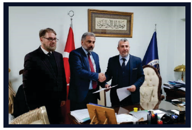
MoU Between (CSRS) Kabul, Afghanistan and Ankara Center for Crisis and Policy Studies (ANKASAM)